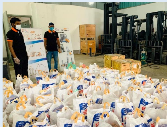
During Covid 19 Pandemic