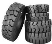
Solid and Press-on Tyre