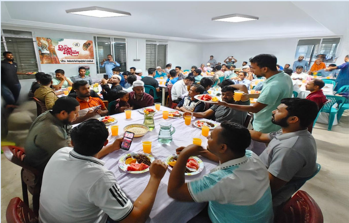
Office Iftar Party