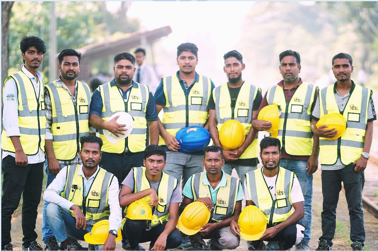
JLG Service Team