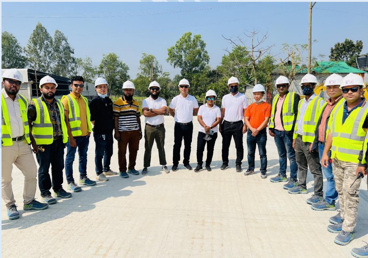
STILL Service Team

Our service team comprises highly trained professionals with extensive experience in maintaining and repairing industrial equipment. They are equipped to handle everything from routine maintenance to complex repairs, ensuring your machinery operates at peak performance.