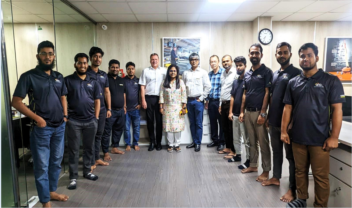
Karcher Service Team