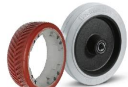
Scrubber Drier Wheel