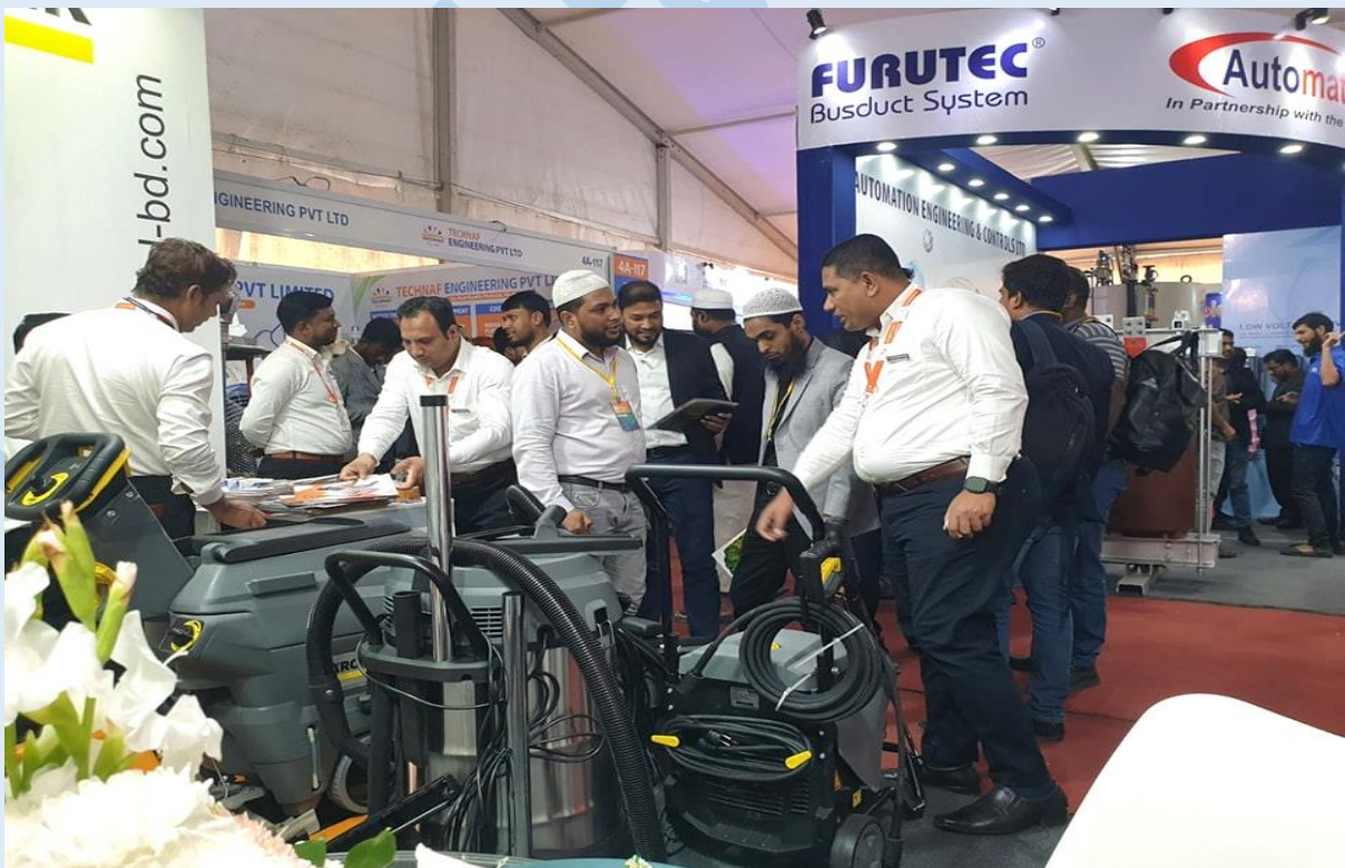
DTG Fair 2024