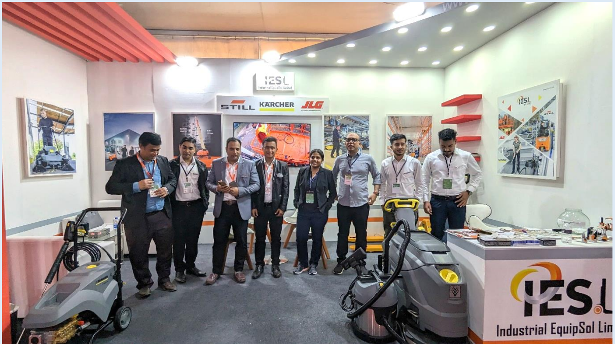
DTG Fair 2024