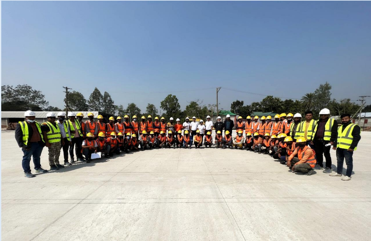
STILL GmbH Team