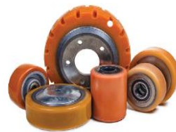
All Kinds of PU Wheel