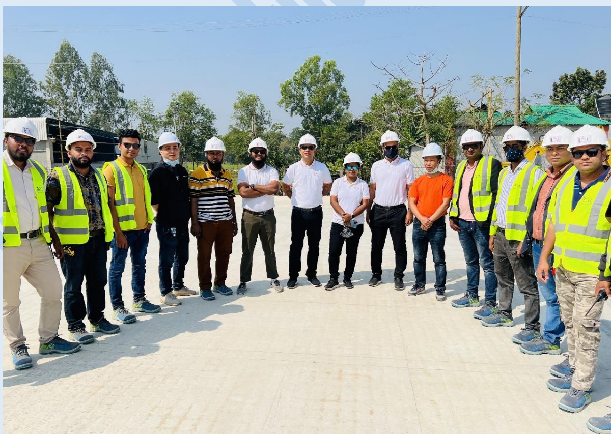
STILL Service Team

Our service team comprises highly trained professionals with extensive experience in maintaining and repairing industrial equipment. They are equipped to handle everything from routine maintenance to complex repairs, ensuring your machinery operates at peak performance.