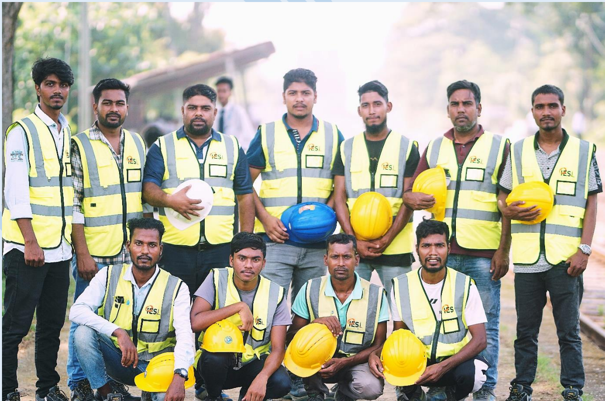
JLG Service Team