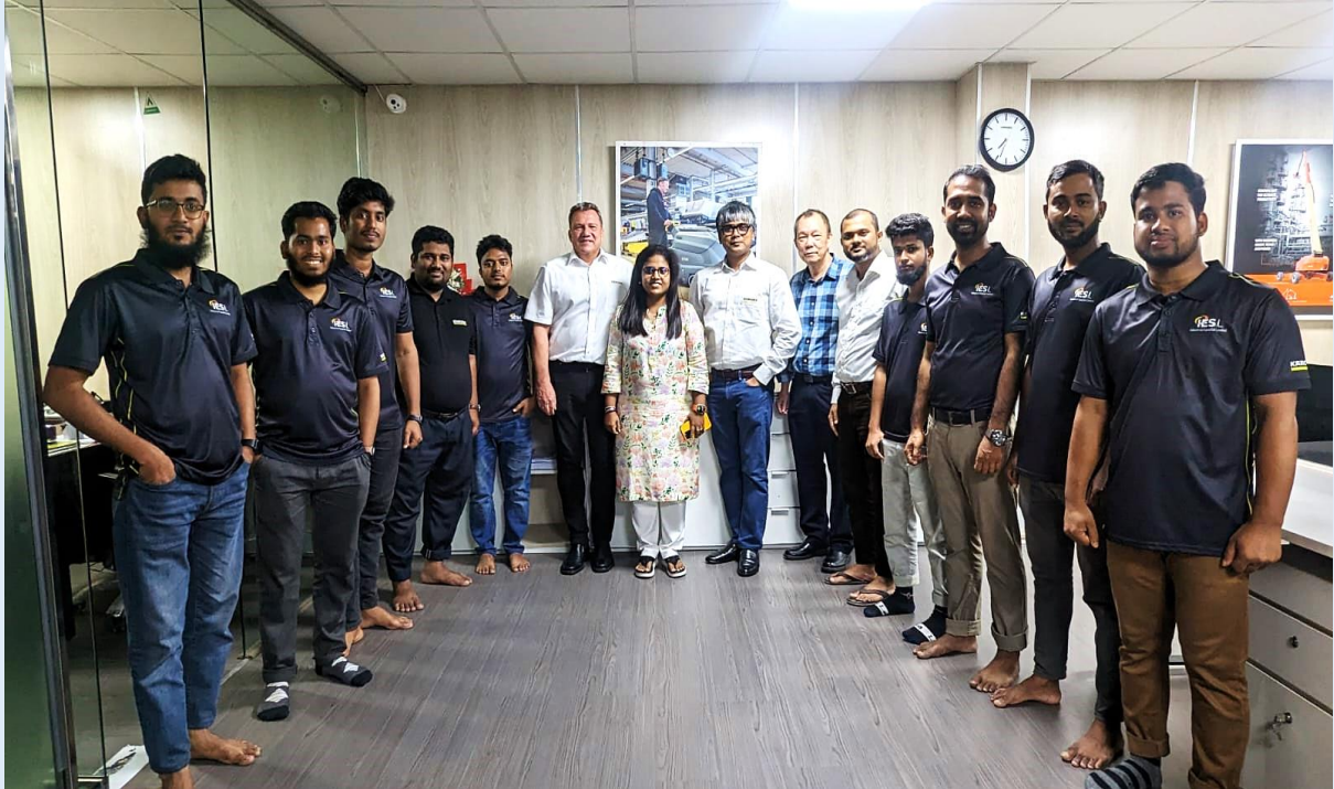
Karcher Service Team