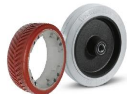
Scrubber Drier Wheel