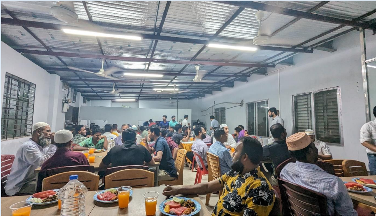
Office Iftar Party